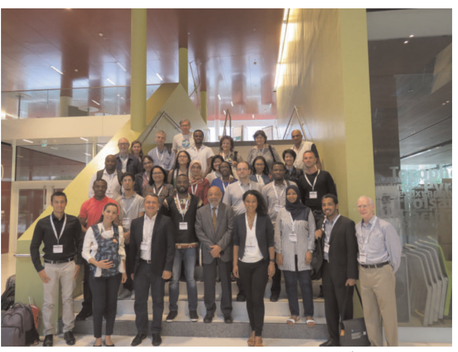
Group picture after the first African Research Workshop 2019 at the 67<sup>th</sup> annual congress of the GA in Innsbruck.